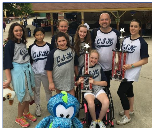
Music in the Parks June 3, 2016